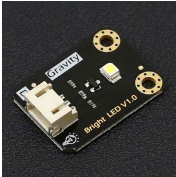
Bright LED Module SKU: DFR0438